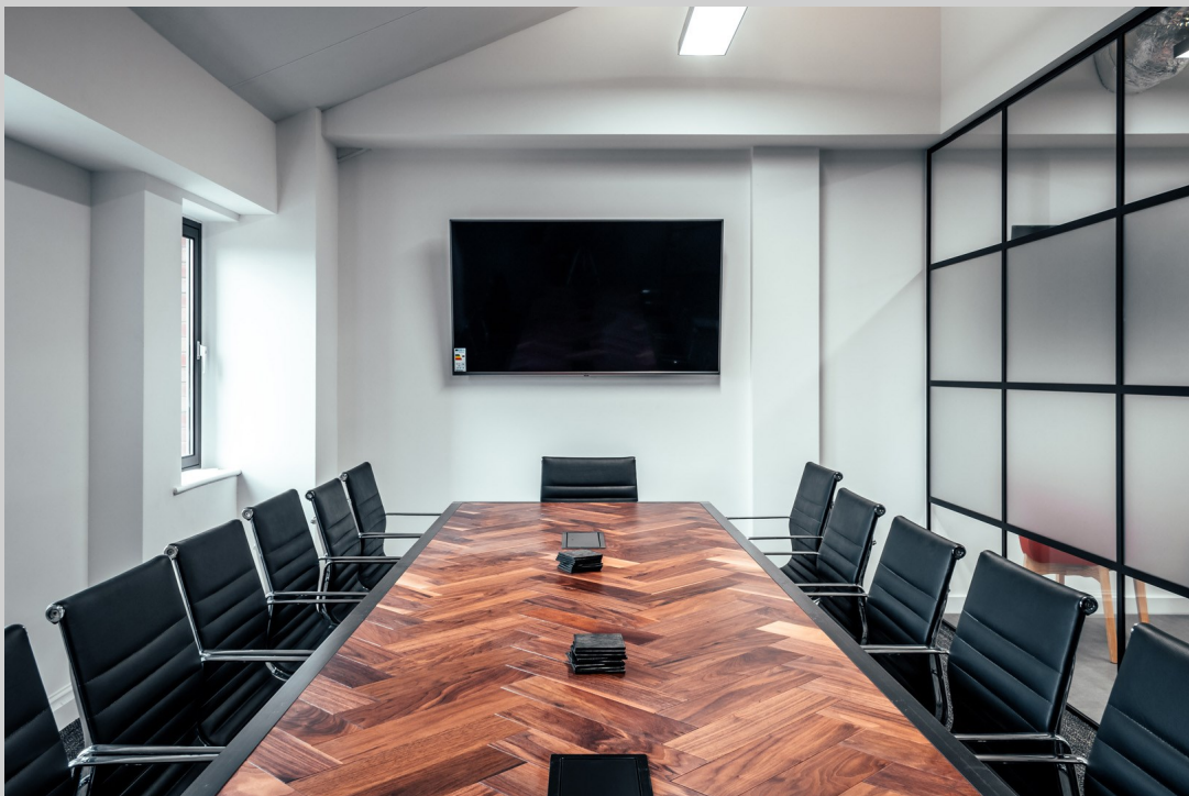
Images of tenant ICS's office space at 2 Park Lane